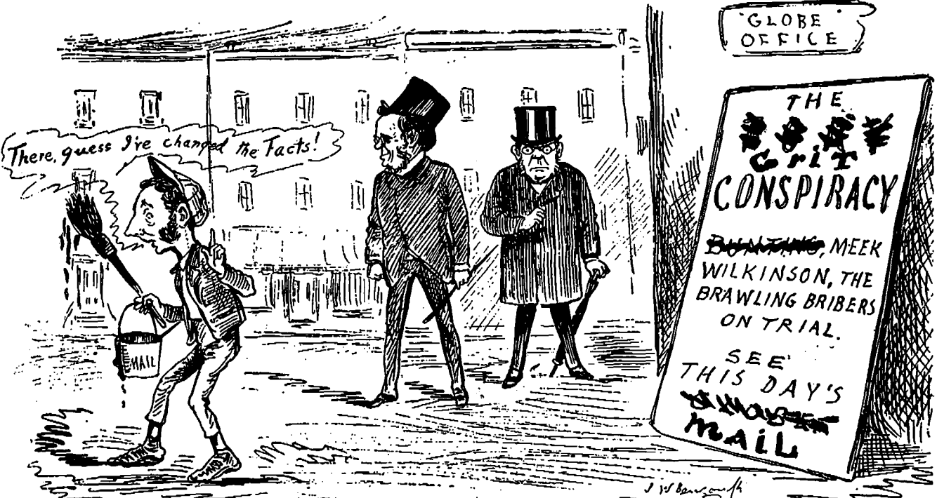
THE SMART BOY MAKES AN ALTERATION.