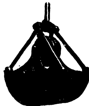
Clam Shell and Orange Peel Buckets.