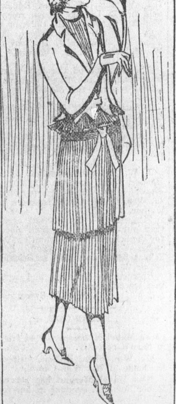
Navy Blue Serge Suit.

practical sort of suit, excellent for traveling and likely to give long and good service because it will not look out of date when supplanted by the