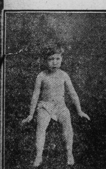
After taking Virol. Weight 30 lbs.

"I regretted it a great deal at first I missed my old friends; but at one