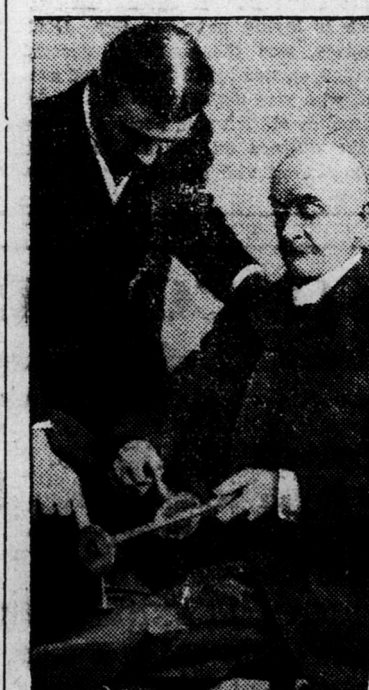
Showing a Rheumatic Sufferer how to use the Veedee.

Is still open for a short time longer for the Sale of Instruments.