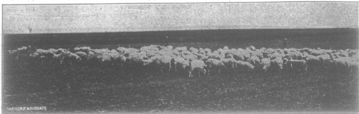
SHEEP HELP TO KEEP DOWN WEEDS ON THE SUMMERFALLOW