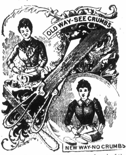
We recommend all interested in buttermaking to obtain a copy of this valuable book. In order to stimulate its circulation we will give two copies to each old subscriber who will send us one new subscriber and one dollar. The above cut represents one of each of the above celebrated knives. Every household should have them. They are made from the very best steel, and warranted to give satisfaction. Full set will be sent for Three New Subscribers.