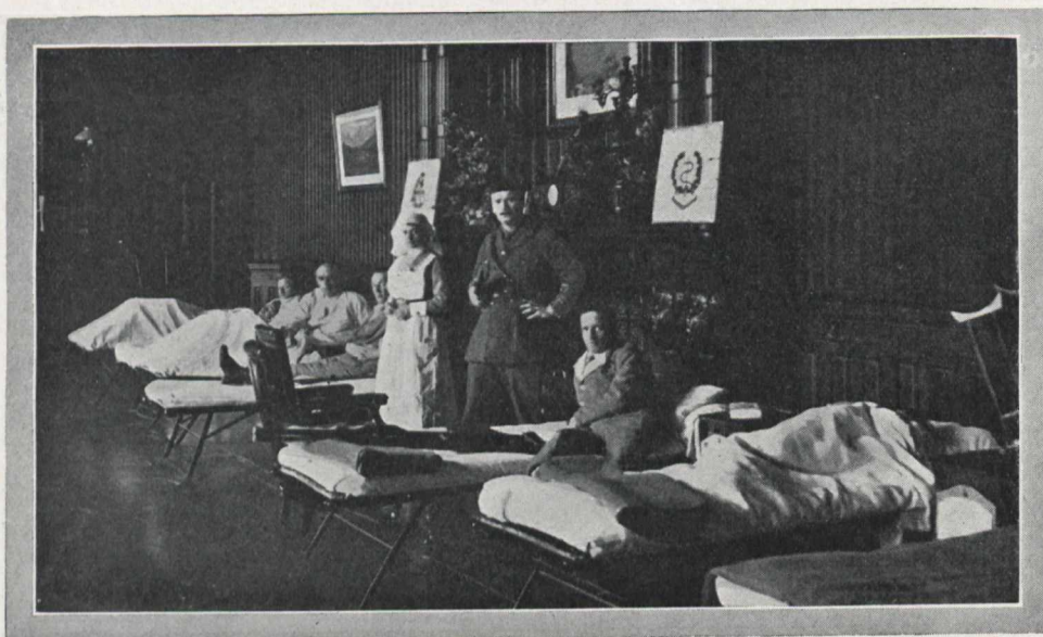
Sick Ward No. 1.

to fifty patients of a suitable type are treated daily.