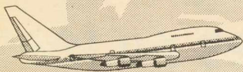
Trips to the Caribbean