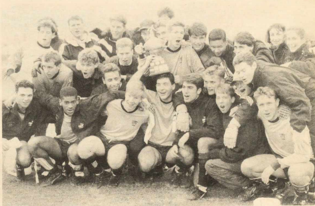
the jubilant men's soccer team