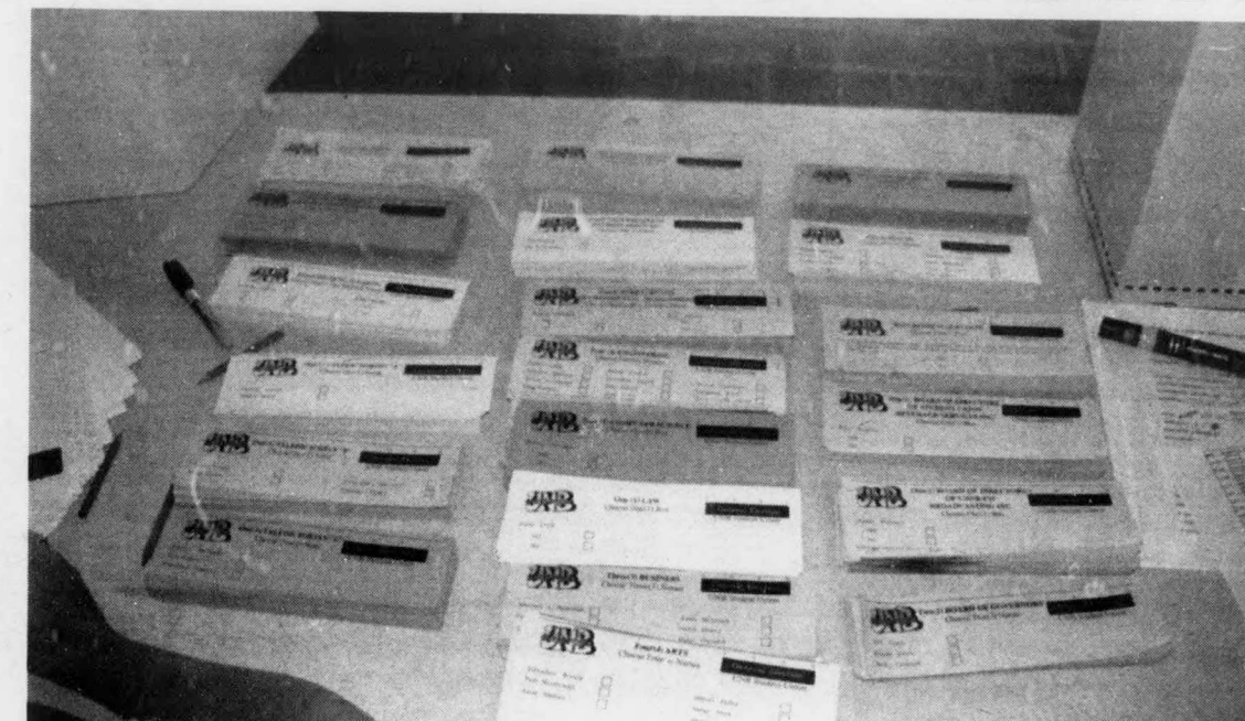
This intimidating sight greeted every student who cast a ballot.