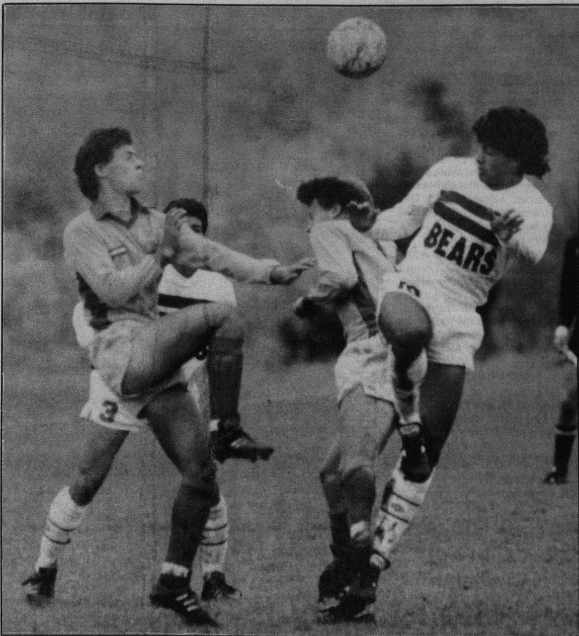
The ball has these four players in defensive postures.