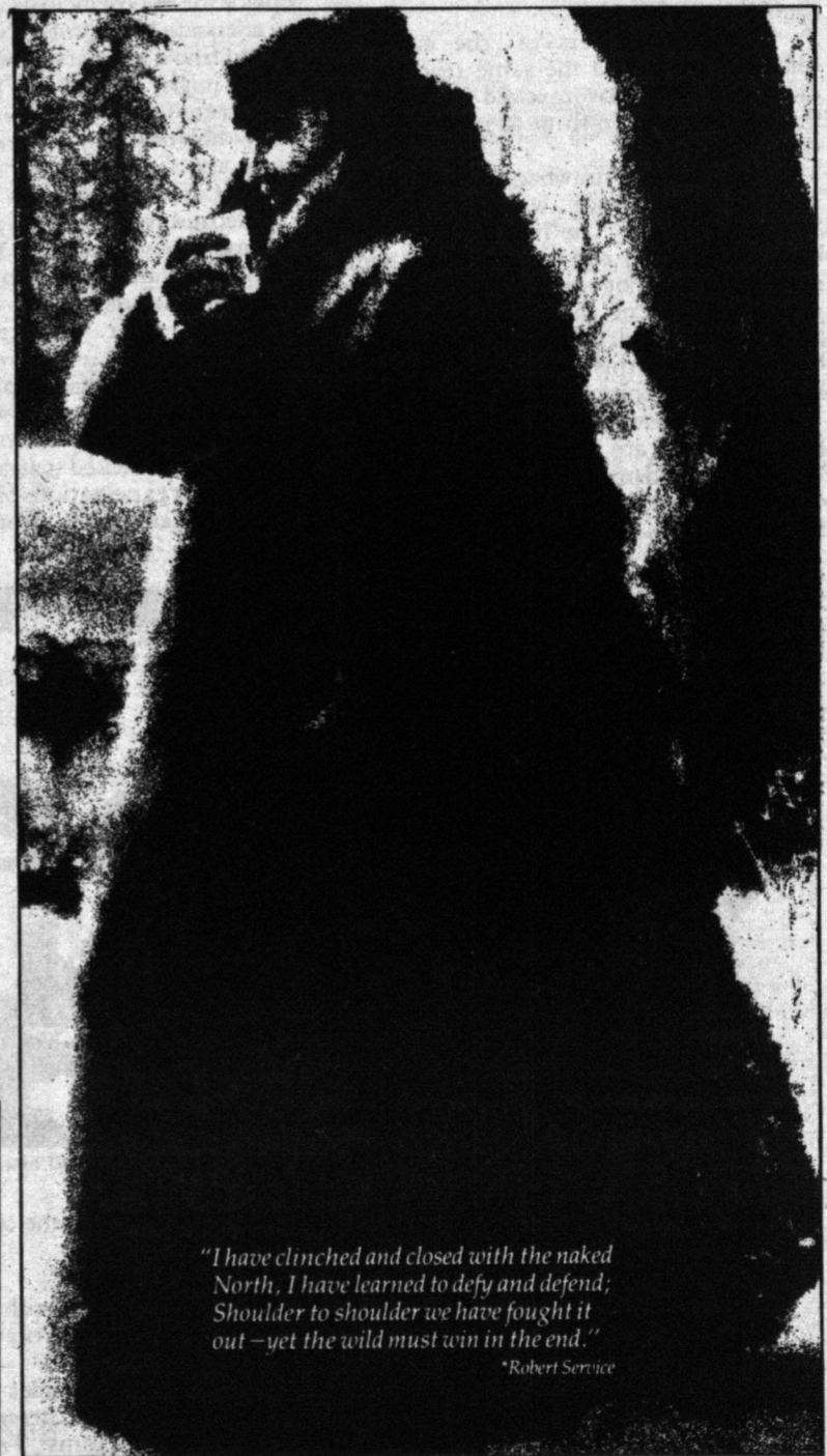
"I have clinched and closed with the naked North, I have learned to defy and defend; Shoulder to shoulder we have fought it out - yet the wild must win in the end." *Robert Service