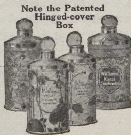
Note the Patented Hinged-cover Box Four odors, Violet, Carnation, Rose—fragrant as the flowers themselves—and Karsi, a rich Oriental perfume.

Deliciously soft, fine, antiseptic and absorbent. Whether used in the nursery or for the toilet or after shaving, Williams' Talc Powder has the same degree of perfection that has distinguished Williams' Shaving Soaps for generations.