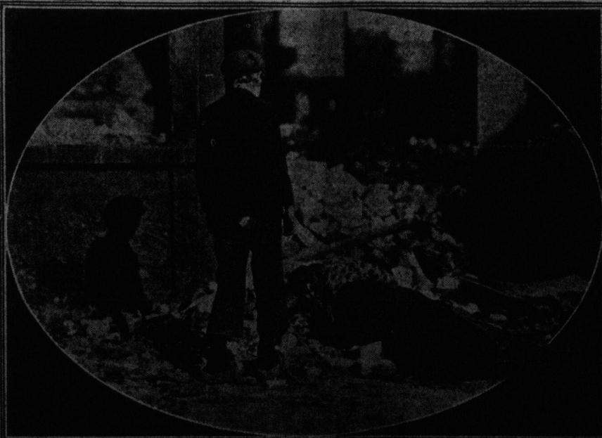
Here is one of the many pathetic incidents from war torn Belgium. The picture, which was obtained by an American correspondent, shows a woman who had been struck by one of the shells of war lying dead among the ruins of a battered building. A young boy is seen looking upon the victim, who may be a relative or some dear friend.