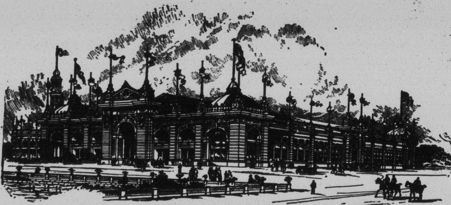
THE MINES AND MINING BUILDING.

for courts, each 88 by 270 feet. These courts are beautifully decorated in color and planted with ornamental shrubs and flowers. The center of the pavilion is roofed by a crystal dome 187 feet in diameter and 113 feet high, under which are exhibited the tallest palms, bamboos, and tree ferns that can be procured. There are galleries in each of the pavilions. The galleries of the end pavilions are designed for cafes, the situation and the surroundings being particularly adapted to recreation and refreshment. These cafes are surrounded by an arcade on three sides from which