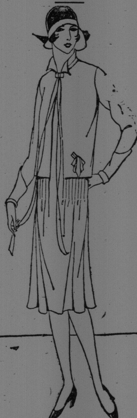
By Marine Belmont

FINE navy rep is the material used for this frock built on extremely youthful lines. The dress has a bolero arrangement, and a skirt which works its fullness to the back by means of inverted tucks. The jacket and cuffs are bound in violet colored rep.