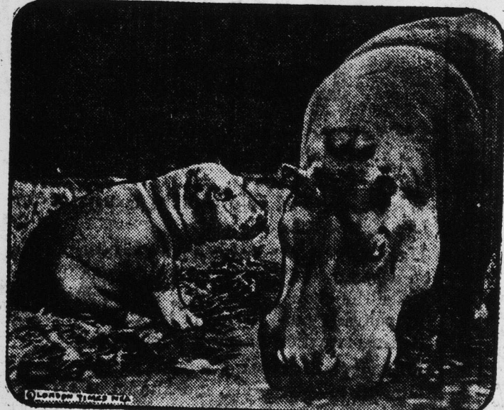
No indicator baby was ever more carefully reared than "Tiny," the baby Hippo shown here, who will doubtless live to be a name. Since Hippo born in captivity are rare, no chances are being taken with this child of the London zoo, which has been getting every scientific attention to insure its health and growth. Both mother and child have been kept in seclusion.