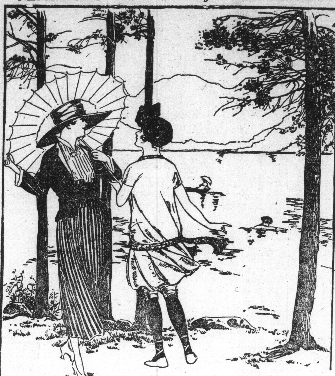
ONE OF THE WONDERS OF WAR.

RAY—Goodness, look at Estelle swimming! Why, she couldn't swim a stroke last summer.