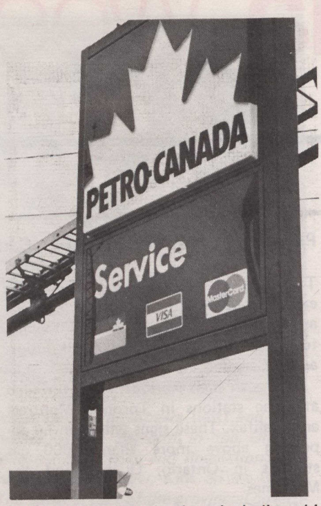
Three Petro-Canada signs including this one in Halifax were unveiled.

Areas off the east coast signify Petro-Canada involvement in off-shore exploration. Dots mark drilling locations.