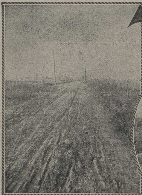
Beaconsfield Station Road, Beaconsfield, P. Q. This is what happened when the road was weaker than the automobile.