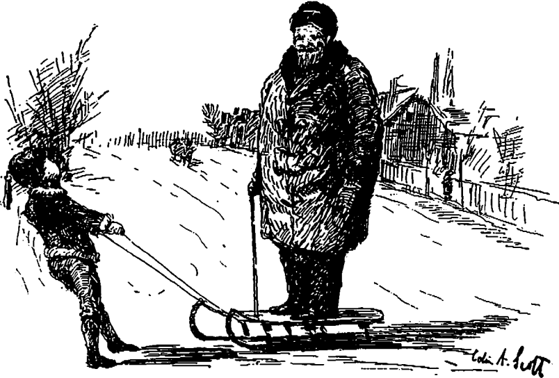
I.—PAPA PAUNCHBY BELIEVES IN ENCOURAGING HIS LITTLE BOY TO TAKE HEALTHFUL OUT-DOOR EXERCISE—