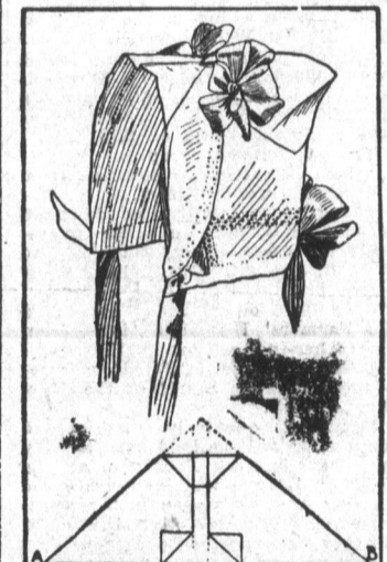
HANDKERCHIEF CAP AND DIAGRAM.

To make the handkerchief cap proceed very much as children do to make a "soldier cap." Fold the handkerchief exactly in half; then fold the two upper or folded corners over to the lower