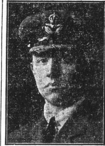
Birdman Appointed A.D.C.

basis, bring a premium of 10 per cent. over the price of thick, smooth hogs. Montreal. Outs, Can. Western, No. 2, 64 to 65c; Can. Western, No. 3, 59 to 30cc extra No. 1 feed, 56 to 57c; No. 2