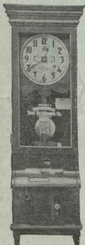
International Card Time Recorder

You show it by installing these two styles of International Time Recorders for registering the time of starting and stopping work.