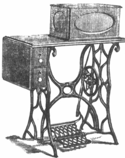
The Genuine Williams Singer

is the most durable and really satisfactory Sewing Machine that is made.