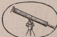
Registered Trade Mark.

Locks in all qualities for Cabinet Makers, Sash Fasteners, Locks and Brassfoundry for Builders' Ironmonger. ALL KINDS OF KEYS MADE on the PREMISES.