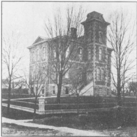
WELLAND HIGH SCHOOL

The origin of Welland dates back to 1788, when a few "United Empire Loyalists" took up homes on the banks of the river at this point. It was mere farm land and practically a wilderness for many years, although the population did grow a little. It was not, however, until 1829, when the first aqueduct was built, that any importance was attached to the place. At that time quite a number of houses and business places were erected, and the little settlement