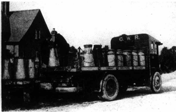
Railway truck services now reach British farms.