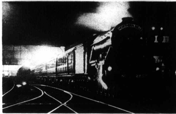
A "hotel on wheels" starting a 2,000-mile tour.