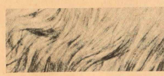
Halifax's first psychedelic shop opened last week. For further story see page 5.