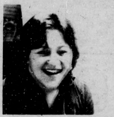
Kojack BBA 3 "Not impressed!"