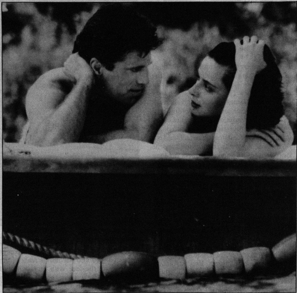
Cousins defines 80s relationships — coping and groping.

The movie is an excellent, very realistic look at what happens when two people fall in love. Rather than concentrating on the two people, it shows that the lives of many others are also affected. A joyful, happy film, it will appeal to those who want a real view of life, and to those who just want a good laugh.