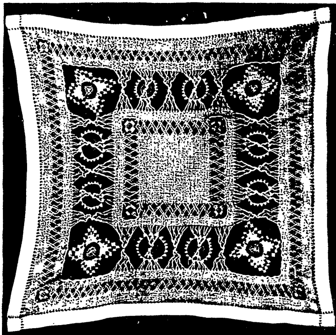
FIGURE No. 1.—DRAWN-WORK PLATE DOILY.

said of the doileys shown at figures Nos. 1 and 2 that their broad borders may be developed on strips of linen lawn and used as insertions in the making of baby gowns or of chemisettes, waists or any garment or article requiring such a decoration.