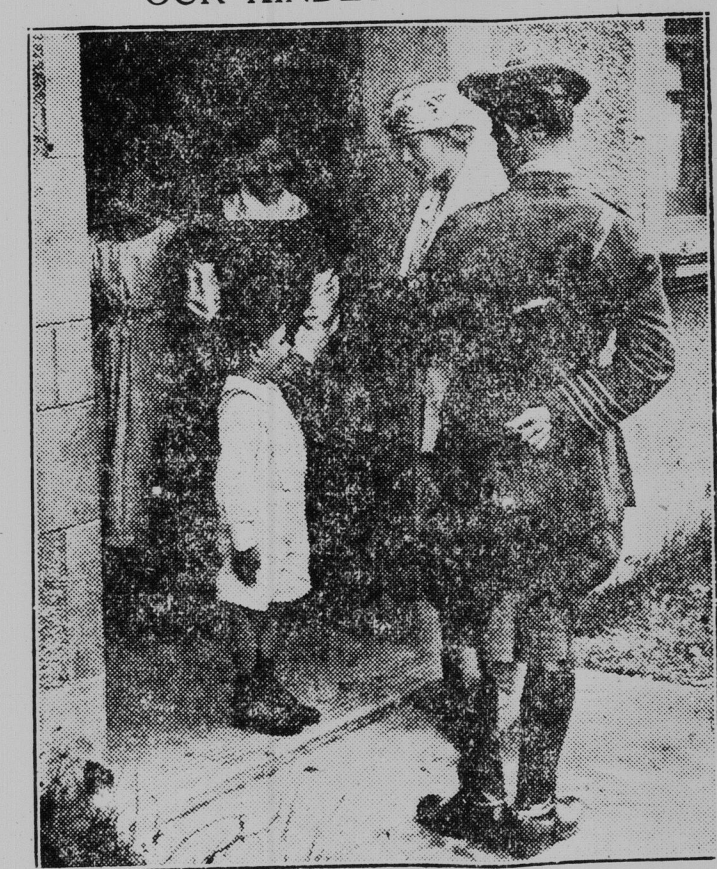
During her recent visit to Scotland, when she inspected the regiment of which she is colonel-in-chief, Princess Mary visited the married men's quarters. She is shown here talking to a young chip off an old block.