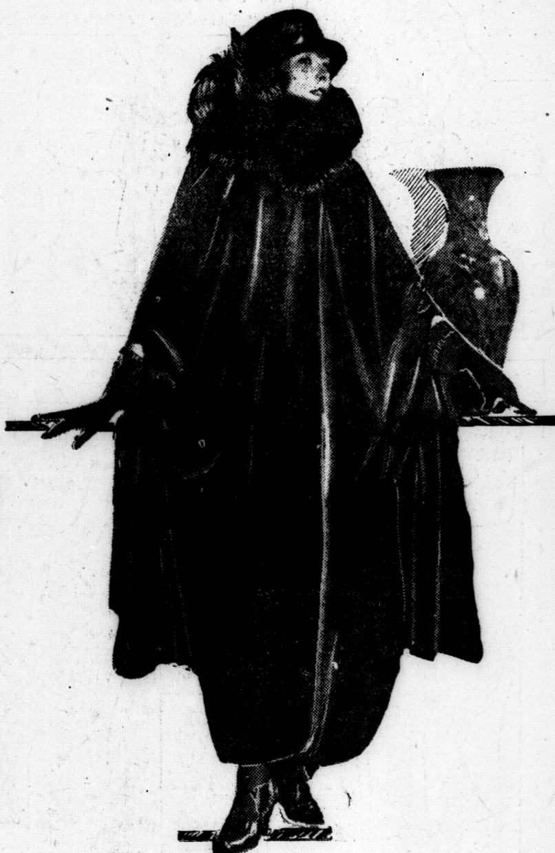
An afternoon wrap in dark brown chiffon velvet with a big choker collar of sable fox.