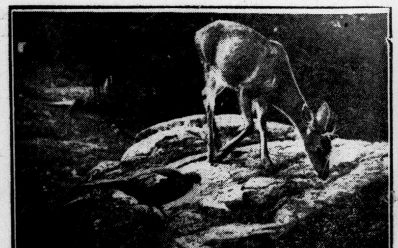
A deer and a pheasant as dinner companions on Hardy Island, British Columbia.