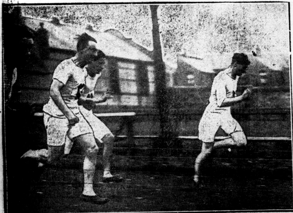
A 100 yards heat at the freshmen's sports at Cambridge University, England.