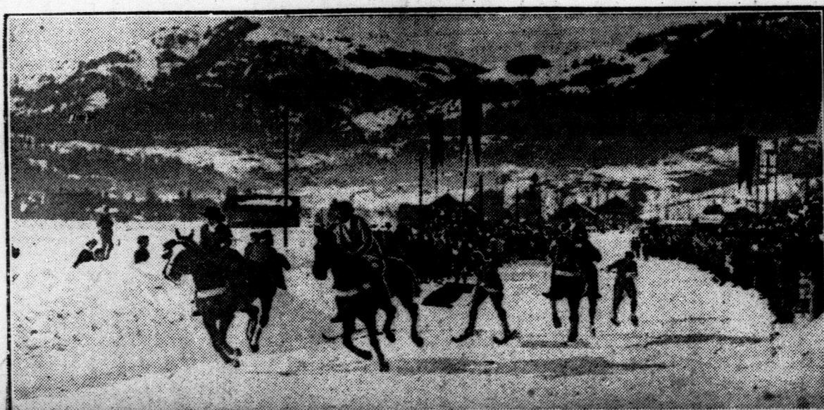
Winter sports have opened in Switzerland. An animated scene at St. Moritz.