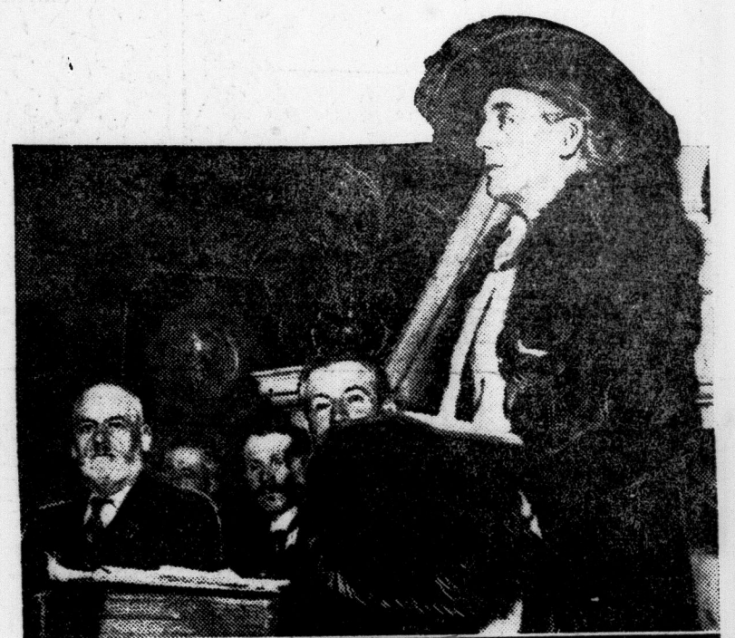
The Countess de Rivas singing a solo at the Wesleyan Chapel, King's Cross, London, England, to the United Railway Temperance Union.