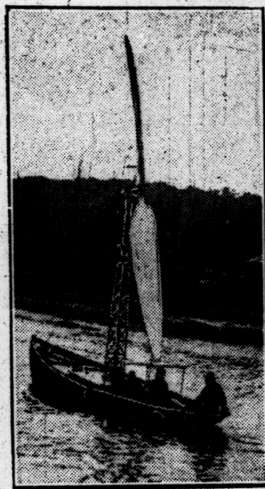
On one of the French rivers there is being tried out this new type of boat driven by a huge propeller such as they use on aeroplanes.