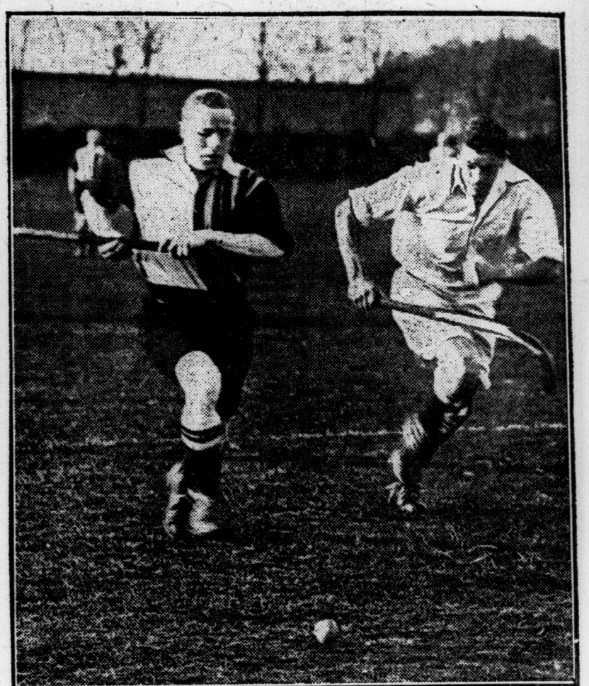
Hampstead and Cambridge Universities meet in hockey at Richmond, England.