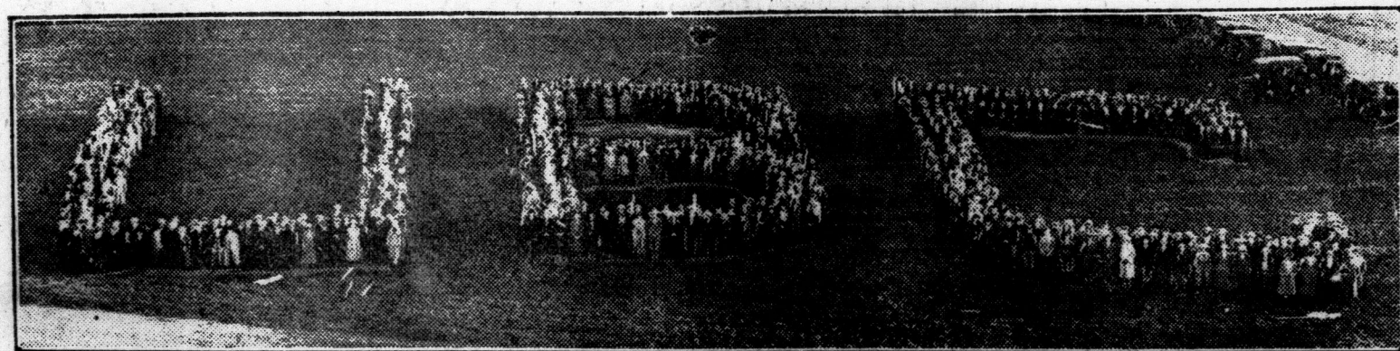
Students of the University of British Columbia in Vancouver recently staged a monster demonstration in support of their campaign to have the college moved from its temporary quarters in the city to the permanent site at Point Grey. This picture shows the students formed into the letters "U. B. C." as part of the ceremonies carried out during the "pilgrimage" to Point Grey.