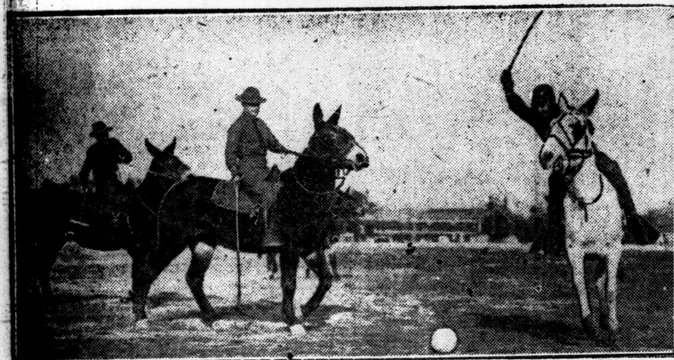
At the army field games at Fort Humphreys, Washington, they played a game of polo with mules. With the players chasing the ball, one of the mules was almost sure to call it a day and stop moving.