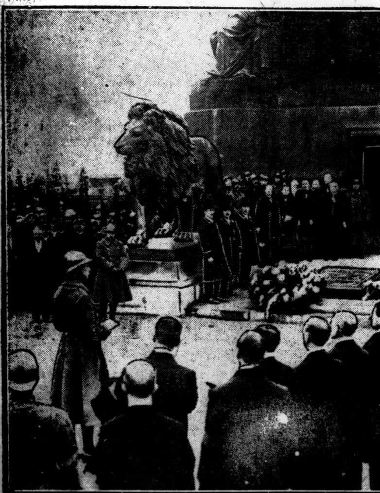
King Albert of the Belgians making an address at the tomb of the unknown hero in Brussels.