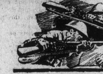
Article No. 7 Cut out for Reference.