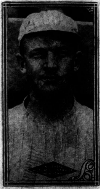
CHRISTY MATHEWSON Celebrated pitcher of the New York Giants.