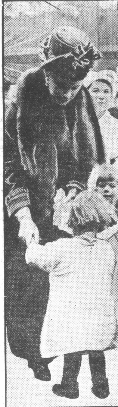
A QUEENLY TOUCH When this little shaver cried Queen Mary stooped to dry his tears. This was when she opened the Stowage Hughes Fields Deptford as a school for babies from two to seven.