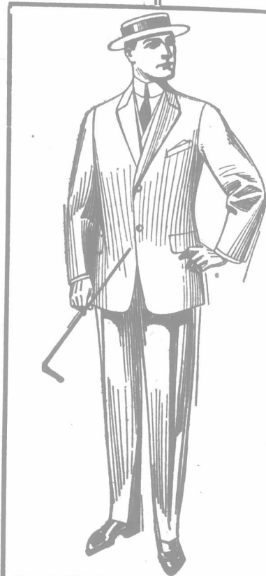
The "ANDOVER" is the fashionable type of single-breasted, two-button suit that is now being worn extensively in London and New York. You will be delighted with it.