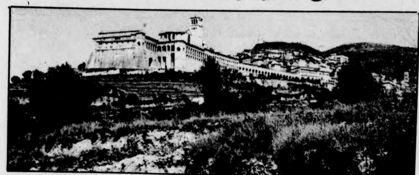
A panoramic view of Assisi, in Perugia, Italy—just one of the fascinating stops along Summer Studies '85's route.