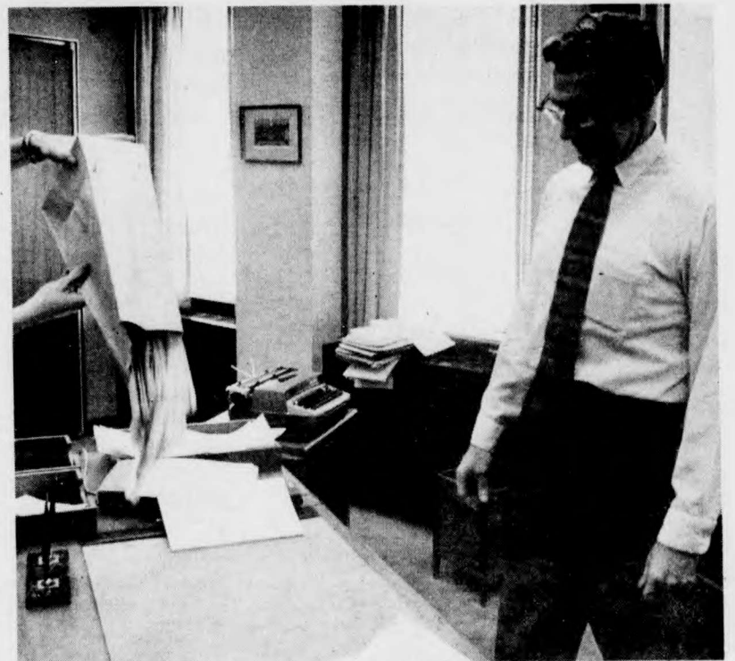
President Slater receives the pigeon letters, sent in by Excalibur's readers, all at once.

I put the picture of the dead pigeon on the wall at Bennington Heights school and the following people signed to protest the killing of the pigeons. We hope these names will point out that this kind of action should not be allowed.