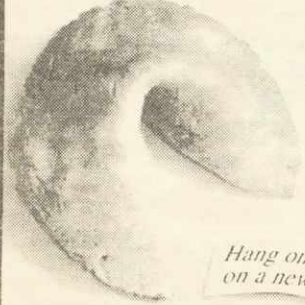
Hang on. You are about to embark on a new career path.

You are on the cusp of completing your degree. There are good jobs now and in the future for IT experts. Consider the possibilities.