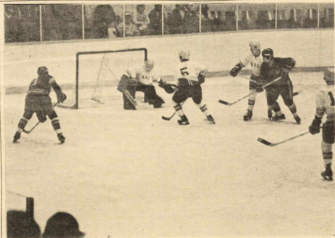
Eagles Buzz Tigers Net