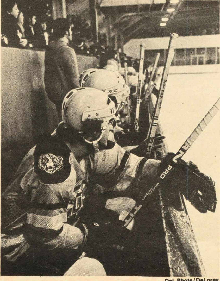
The sports scene at Dalhousie is quiet now with most athletes finished for the

I've found that they have come a long way. I don't see it as a women-