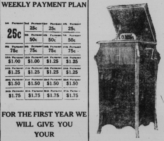
RECORDS FOR THE FIRST YEAR FREE