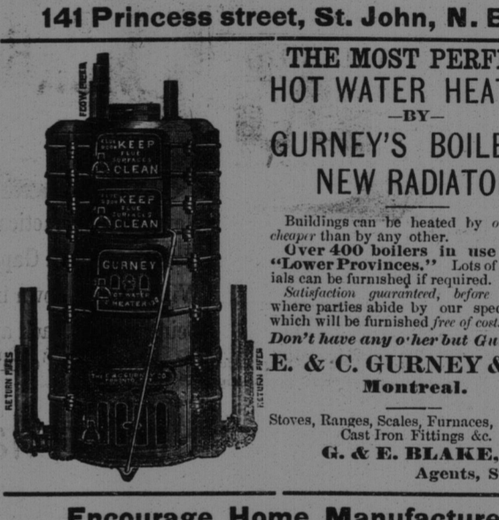
THE MOST PERFECT HOT WATER HEATING - BY - GURNEY'S BOILER & NEW RADIATOR.