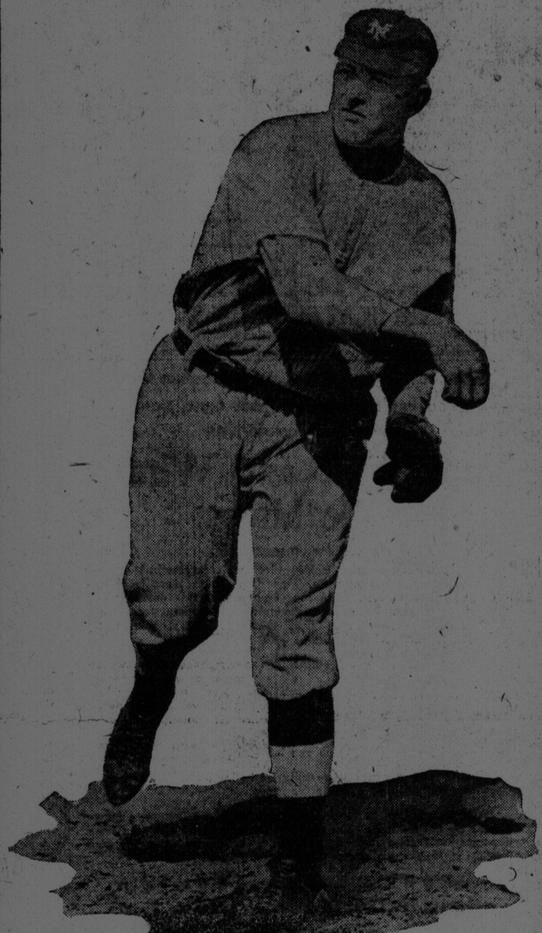
MATHESON

New York, Oct. 21.—The player who stands out most prominently in the last game of the world's series, as well as two others, is Christy Matheson, the Giants' veteran pitcher. He was as grand in defeat as he has been in his many, many historical victories in the last dozen years.