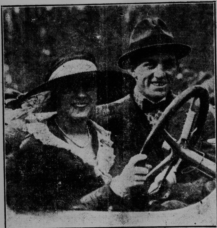
Georges Carpentier, champion French boxer, and his bride out for a spin in their car.