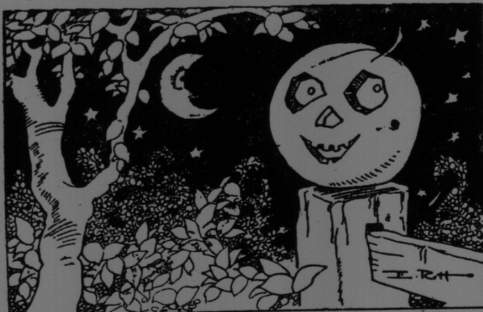
And Jack o' Lantern on top of a post.

"The laziest fellow I ever knew lay out in a cornfield and grew and grew. It wasn't the scarecrow, goodness no! For why should a scarecrow care to grow?" "He looked at the sky as he lay in the shade, and the sun was shining bright. That the gracefully waving cornstalks made, and he said to himself with a chuckle, 'Ah, me! The sun's the color I think I'll be.'" "So he deepened by day to a rich dark yellow, all the time growing bigger, this lazy old fellow! Indeed it's a wonder his shiny tight jacket didn't burst up the back with a horrible racket!" "Summer flew by and the autumn came, and there lay old Lazybones just the same. His friends, the obliging kind cornstalks, were dried up and withered and stacked in shocks. "That's the way with the world," said our Lazybones friend, "Most everything else must come to an end. But not for important folk, such as I, I and the sun up there in the sky." "I can't grow any more, so I think I'll snooze," and off he dropped—not a minute to lose. But there came just then the farmer's good wife, with (what do you think?) a long sharp knife! "The next day Lazybones stretched with a yawn, 'My goodness!' he cried, 'The winter's gone! I never in all my life was so hot. Or perhaps it's a fever that I've got!'"