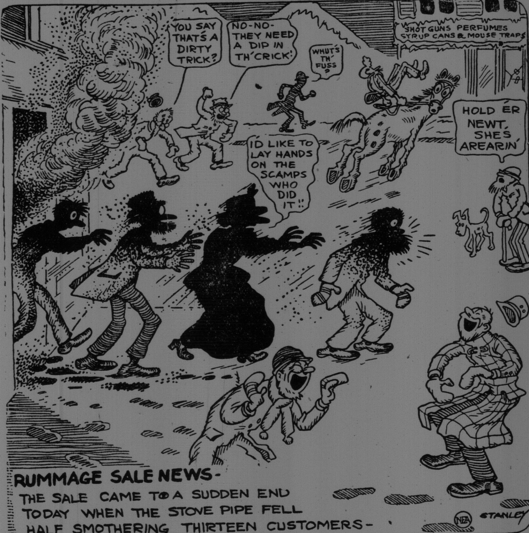
RUMMAGE SALE NEWS—THE SALE CAME TO A SUDDEN END TODAY WHEN THE STOVE PIPE FELL HALF SMOTHERING THIRTEEN CUSTOMERS—