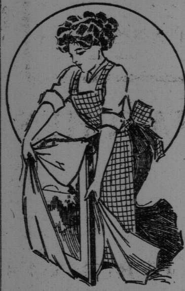
Remove the Heavy Pictures

The windows in the dining-room may be draped with each curtains of hemmed dotted swiss and the walls left entirely